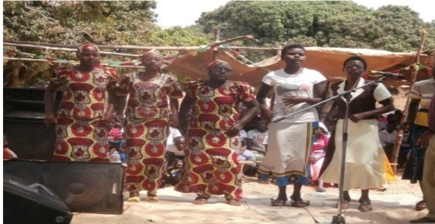
From left to right are pictures of youth revival meeting

Here below is a picture showing youth and women revival meetings in Ruyigi.