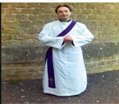
A Deacon in the UMC