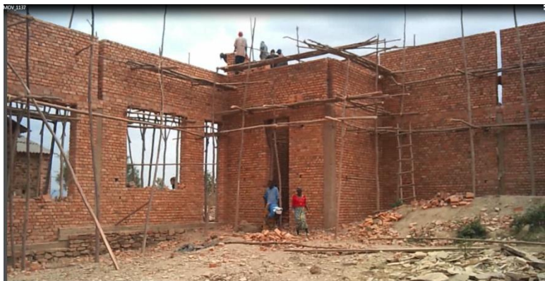
The picture above shows where we have reached so far.

Murehe church construction is still under construction. Murehe congregation has already contributed $ 50,000; from where it has reached so far, Murehe church construction needs $ 50,000 to be completed.